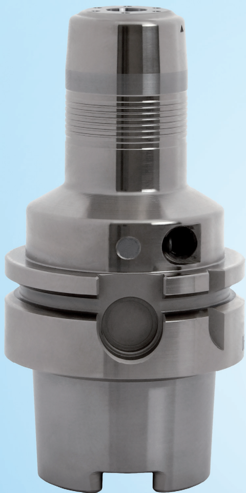
PHC-A Power Hydro Chuck